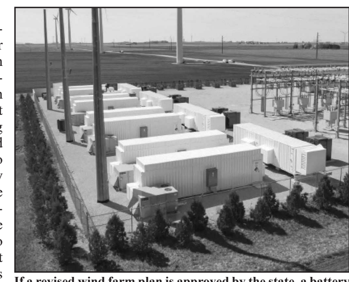
If a revised wind farm plan is approved by the state, a battery energy storage facility like this one will be built in Morrow If approved, the new County. The facility has 3,000 batteries and stores power gen-

the ODE to put the re-The proposed wind vised plan on a fast track Wheatridge West located not alter the original plan public hearings and public