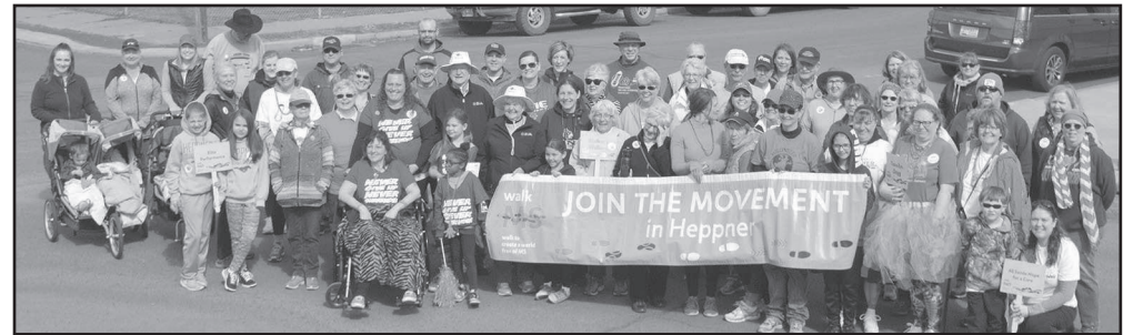
Pictured are participants in the 2017 Walk MS event.

The MS Walk to raise funds for multiple sclerosis will be held on Apr. 21 at the Roy Raley Park in Pendleton this year, instead of in Heppner. Registration is at 9 a.m. with the walk beginning at 10.