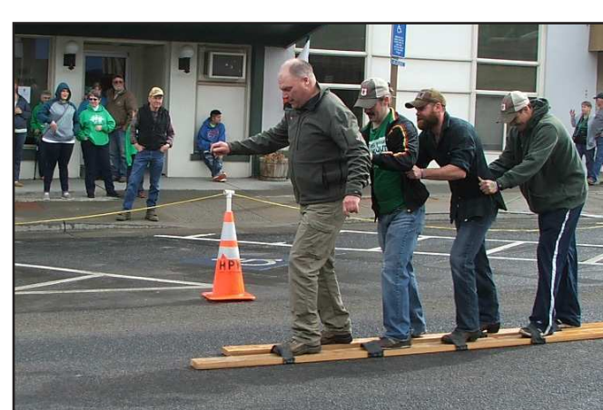
2017 O'Plankey Races

For the second year, the O'Planky Team Relay Race Competition returns to offer a challenge: This event will start at 11:30 a.m. and go the other direction of the Bed Races. Teams consist of four participants. Teams will start at the Shamrock and race to the end of May Street, turn around and return back to the shamrock to complete the race. All teams must report to the shamrock by