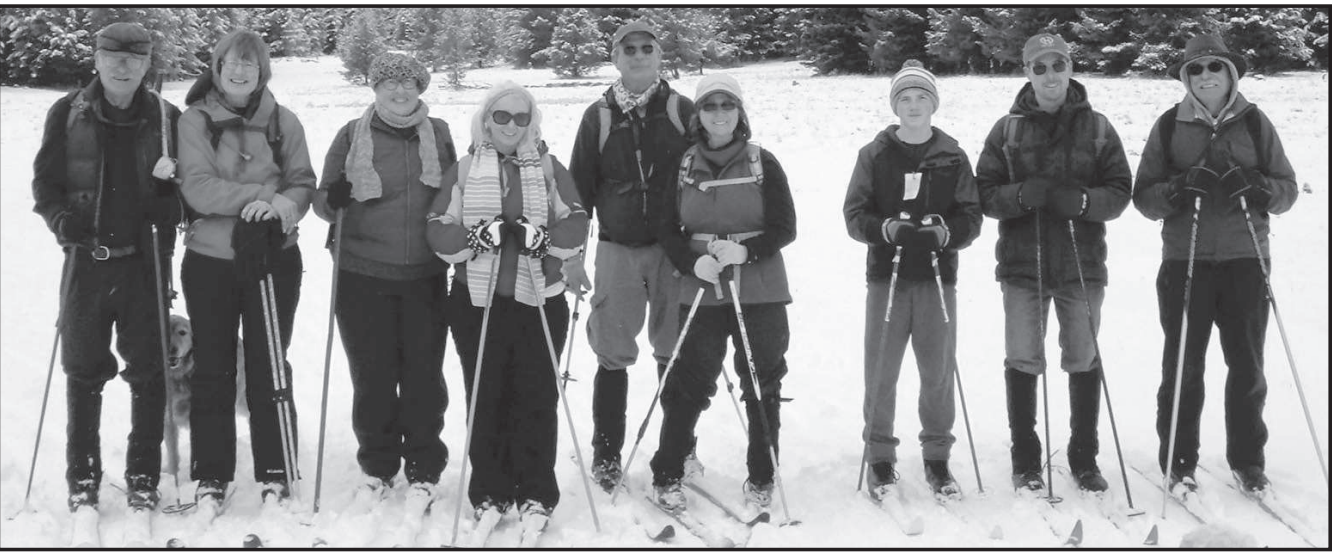
Ten skiers enjoyed fresh snow conditions for the Arbuckle Nordic Clubs weekly ski trip Saturday, Jan. 20. The group started out at the snow park at the top of Coal Mine hill and skied Heron Meadow and then east up the 750 road.

Chamber announcements and upcoming events