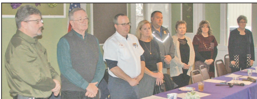
The Heppner Chamber of Commerce elected its new officers at its annual meeting held last week.