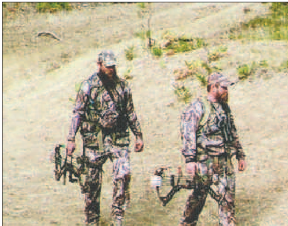
OSP is asking for the public to help identify these two men that may be involved in the illegal killing of three elk in the Heppner unit.

Two individuals that were caught on camera on private property are being sought by the Oregon State Police Fish and Wildlife Division. The subjects were contacted and told they were on private property in Morrow County.