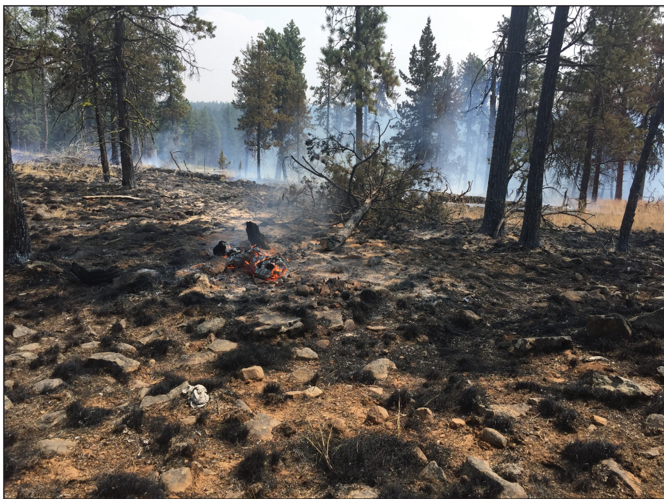
Aftermath of fire at Tupper Corral

PENDLETON, Ore. — Friday and Saturday night brought thunder/lightning storms to our region, which were accompanied by rain. Significant lightning activity occurred across the southern end of the forest, with multiple new incidents reported to the Blue Mountain Interagency Dispatch Center (BMIDC) and John Day Interagency Dispatch Center (JDIDC). The Heppner Ranger District