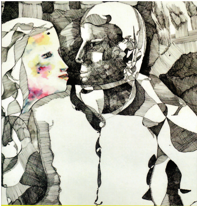
Andrew Sykes ~ Figments

Exhibit June 9 - July 28 Opening Reception June 9, 6-8 pm Hours m-f 10am-4pm Sat noon-4 Art Center East 1006 Penn Ave La Grande 541-624-2800