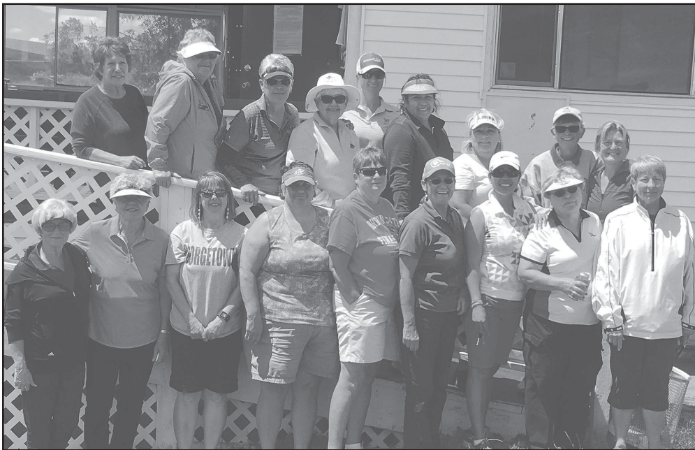
Twenty women participated in the 25th annual Jo Pettyjohn Tournament last weekend at Willow Creek Country Club.