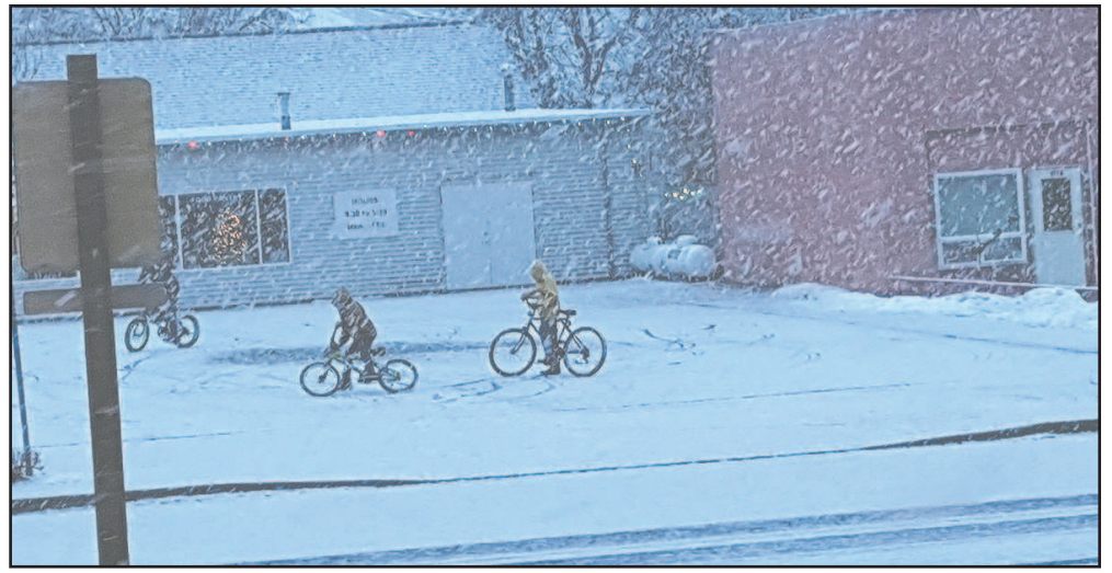
Children ride their bicycles in the snowy parking lot of the Neighborhood Center in Heppner during a December snow storm. The snowy December was one of the top weather events for 2016. -See full story at 2016 WEATHER/PAGE FOUR