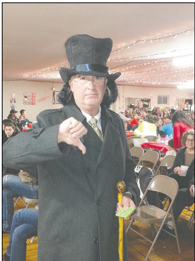
Scrooge is the only one who would give a thumbs-down to the Celebrate Heppner Christmas event. The annual event will take place at the Morrow County Fairgrounds next Thursday, Dec. 15, beginning at 6 p.m.

-Continued from PAGE ONE to make sure they put their names on each reward card and put them in the items they would like to be drawn for before that time. There will be an area to exchange cards if desired.