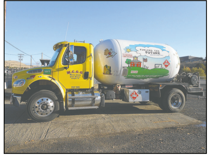
Morrow County Grain Growers bought out PGG’s propane division in a move that both co-ops say will be good for their members and their bottom lines. -Contributed photo