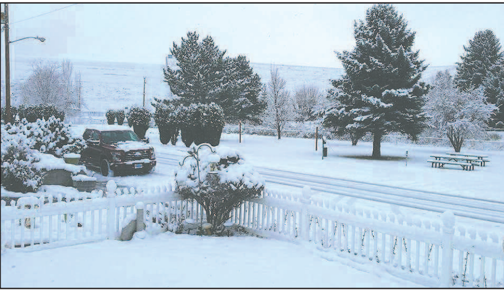
Heppner’s Hager Park and Willow Creek Dam were transformed into a winter wonderland by the snow storm that crossed the area Monday night. According to the National Weather Service, cold and moisture like this will be the order of the day for the rest of the month.

High temperatures this year averaged 57.2 degrees, which was 6.4 degrees above normal. The highest was 72 degrees on the sixth. Low temperatures averaged 38.4 degrees, which was 6.7 degrees above normal. The