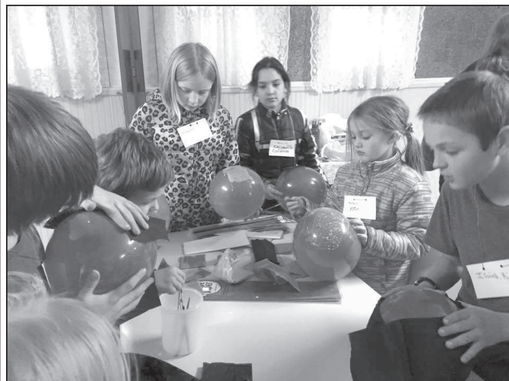
Organizers reported a good turnout at the first-ever Super Stars Kids Club after school on Monday at the Heppner United Methodist Church. The group completed art projects, tried singing in the round, learned to make Ants on a Log and a shared a spaghetti dinner. The next meeting will be Dec. 26. For registration information, call the church at 541-676-5444 or email heppneroregonmethodists@gmail.com.