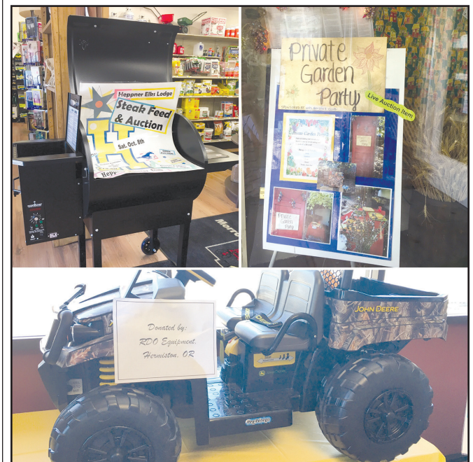
Donated items like these, and more, will be auctioned off at the Heppner Booster Club steak feed and auction Oct. 8 at the Elks.

"Many items will continue to be put on display as they come in over the next week at Murray's Drug in the front window; be sure to stop and by and see what's there—we truly will have