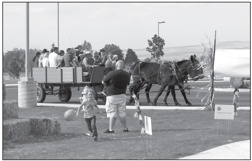
Attendees at last year's harvest festival pile in the mule-driven wagon for a ride. Over 800 people attended the event.

"The Morrow County chambers of commerce and the SAGE Center wanted to