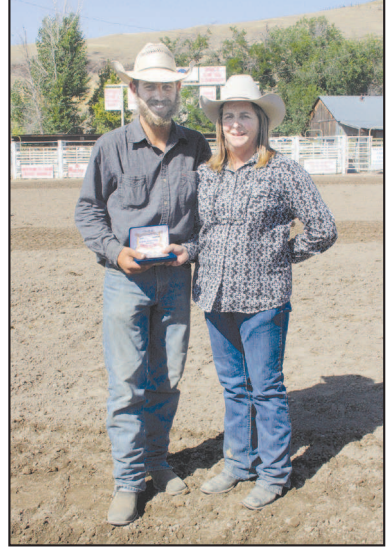
The buckle was sponsored by Miller & Sons Disposal Service.