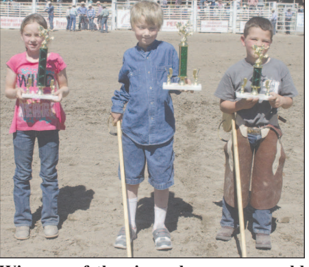
Pro Rodeo committee.