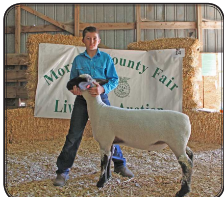
Raised by: Tucker Ashbeck, Critters With Attitude