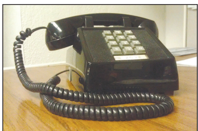
Locals have been warned that phone calls purporting to be from Dish Network may not be what they seem.

MCSO says it's a sure sign of a scam if they ask you to confirm the first numbers from your credit card—companies with whom you do business card number on file and, if company rather than giv- not call its customers.