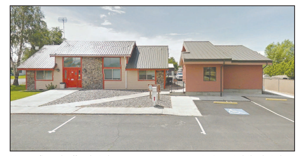
Morrow County's offices in Irrigon are currently located at the Annex building in Irrigon. These facilities are too small and outdated and need to be replaced, according to county officials.

Court presented with 60-signature petition against leaving Irrigon