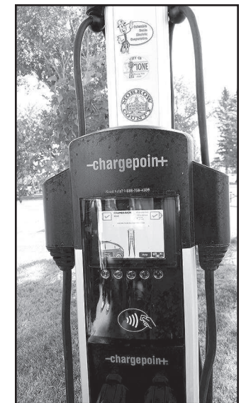
Electric car charging stations like these will be installed in Heppner, Ione, Condon and Fossil.

positive response to this project, and hope that by electric car owners have bringing in this new-age access a phone app that technology to the area, we shows exactly where all of will attract new visitors to the car charging stations our communities," stated