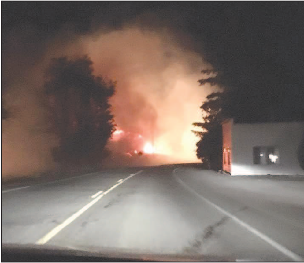
The fireworks show in Ione was cut short this year when stray sparks drifted across Ella Rd. and into tall-standing rye, causing a fast-burning grass fire toward the Emert Addition.

Fire crews from Ione and Lexington were on scene as is typical for the fireworks show, and worked quickly to arrest the fire's progress before it reached the Emert homes. Morgan said no structures were