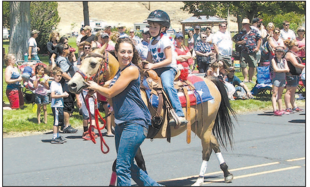
It was an eventful day full of festivities at Ione's Fourth of July celebration this year. See more photos PAGE THREE.