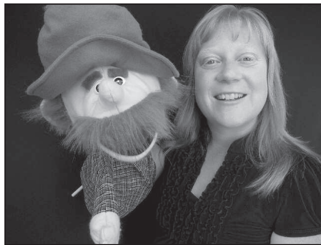
Penny's Puppets is coming to Heppner and Ione next month courtesy of the Oregon College Savings Plan.

While at the libraries enjoying the performances, parents are encouraged to pick up an entry form for