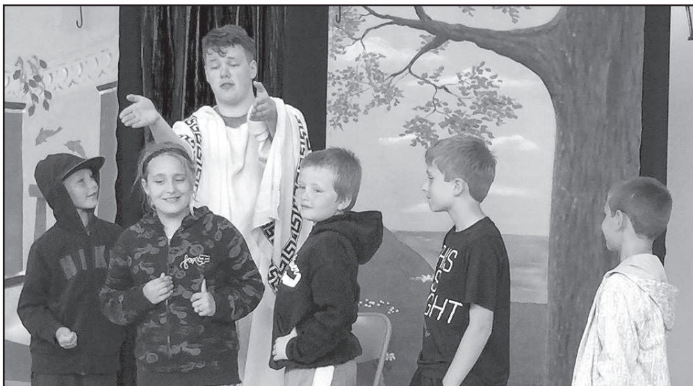
Ione Public Library's summer reading program kicked off Monday, June 13, with registration at the Traveling Lantern Theatre's "Vladimir Goes for Gold" show, which invited audience members to imagine participating in the Olympics. The free reading program continues Tuesday mornings from 10 a.m. till noon through July 26; children entering kindergarten through sixth grade are invited to attend.