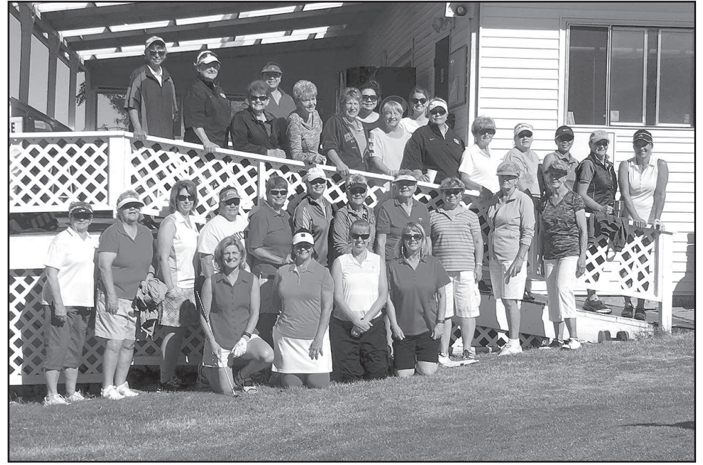
The annual Jo Pettyjohn Memorial Golf Tournament took place this past weekend at Willow Creek Country Club. Lady golfers from throughout Oregon and Washington attended the event.