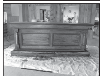
Before and after the bar renovation.