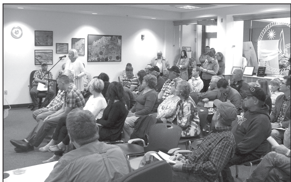
A public hearing on a proposed wind farm in Morrow County drew a large crowd at Boardman City Hall last week. Above, people listen to public testimony about the wind development.

Previous to the start of the hearing the Facility Siting Council told members of the audience that it was necessary to submit either written or oral testimony in order to be "eligible to participate in a contested case on this application." The Oregon Department of Energy earlier had issued