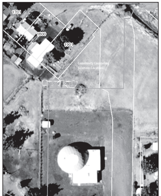
A new Community Counseling Solutions facility is planned at this location on Sperry St. in Heppner.

FIND US ON FACEBOOK WWW.FACEBOOK.COM/THELANDINGLODGE