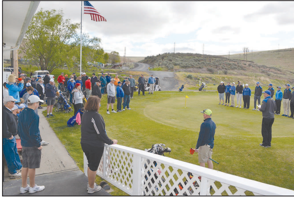
The annual Mustang Scramble at Willow Creek Country Club saw a good turnout this year.