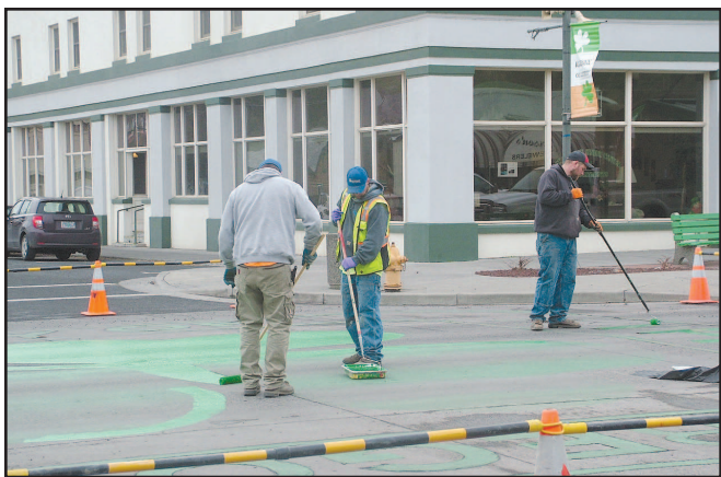
City crews repaint the shamrock on Heppner's Main Street in preparation for the Wee Bit 'o Ireland celebration this weekend.