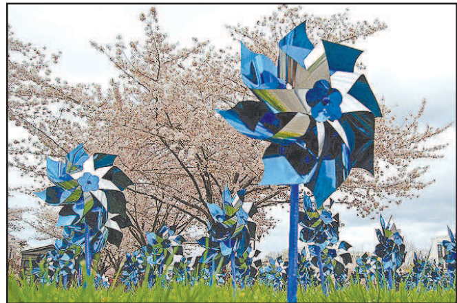
Pinwheel gardens like this will pop up throughout Morrow County in April in recognition of Child Abuse Prevention Month.