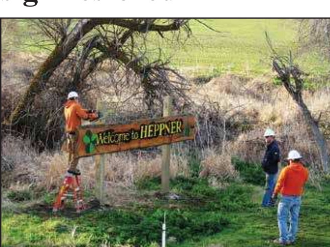
CBEC employees assist with project

Community Enhancement funds from the Columbia River Enterprise Zone (CREZ) provided resources which enabled the Welcome to Heppner sign at the northwest entry to town to be rehabilitated.