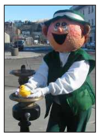
St. Pat's leprechaun

"Whether you are Irish when you come, you will certainly be Irish when you leave... so come and join us for a great weekend."