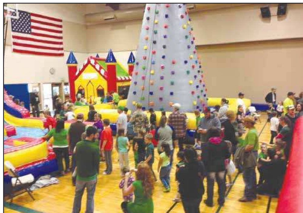
The Bouncin' Leprechaun Fun Zone was a big hit at last year's Wee Bit o' Ireland celebration, and it's back this year on afternoon of Saturday, March 19.

For the really young crowd there will be a bouncy house and a mini carnival, which will include a bean bag toss, ducky pool and plinko.