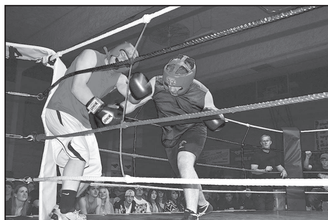
A boxer has his opponent on the ropes at last year's Irish Smoker amateur boxing event in Heppner.

anyone interested should call the chamber office at 541-676-5536 or email heppnerchamber@centurytel.net to get information or sign up.