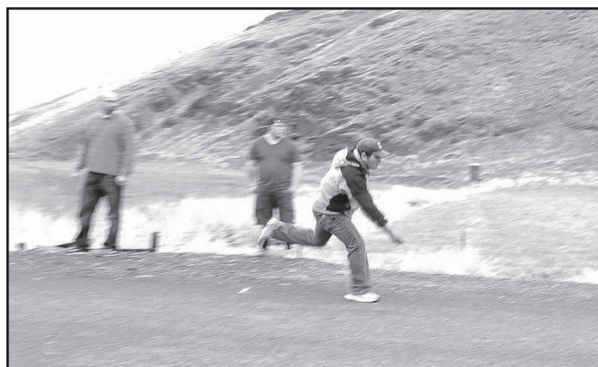
Participants in last year's road bowling.

Heppner's Irish Road Bowling event will draw the St. Patrick's weekend celebration to a close on Sunday, March 20. Participants in this event will gather on Sunday afternoon before the 1:37 p.m. activity commences.