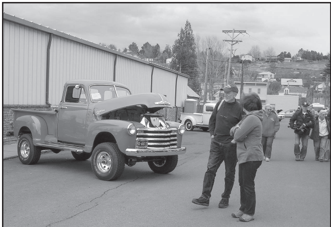
Classic car enthusiasts take a look at entries in last year's Cruz-In.

On March 19, the 15 th annual St. Paddy's Cruz-In will be held during the 34 th annual St. Patrick's Celebration in Heppner.