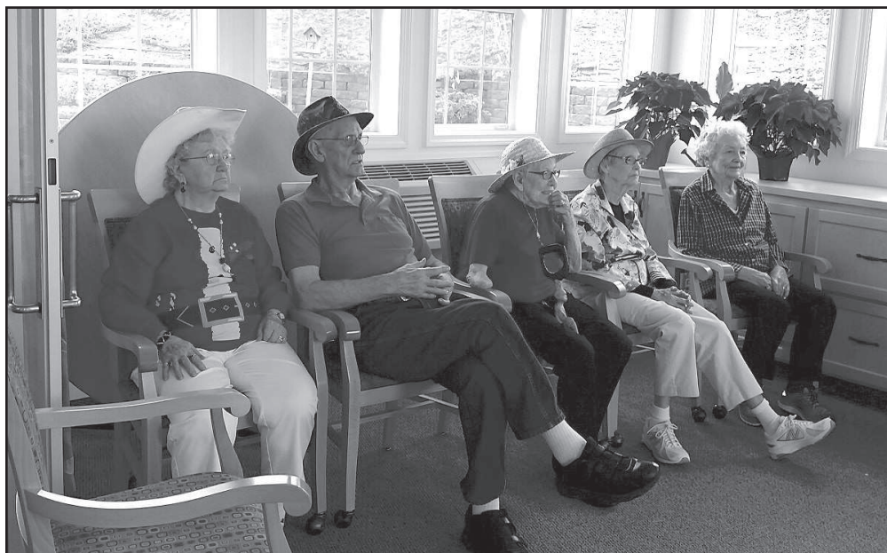
Willow Creek Terrace residents participate in weekly Brain Games while decked out for National Hat Day.