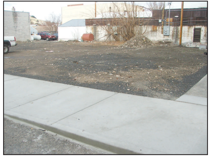
The city of Heppner sold this lot on Willow Street with a sealed bid Monday.

The city had originally come into ownership of the land years ago as part of