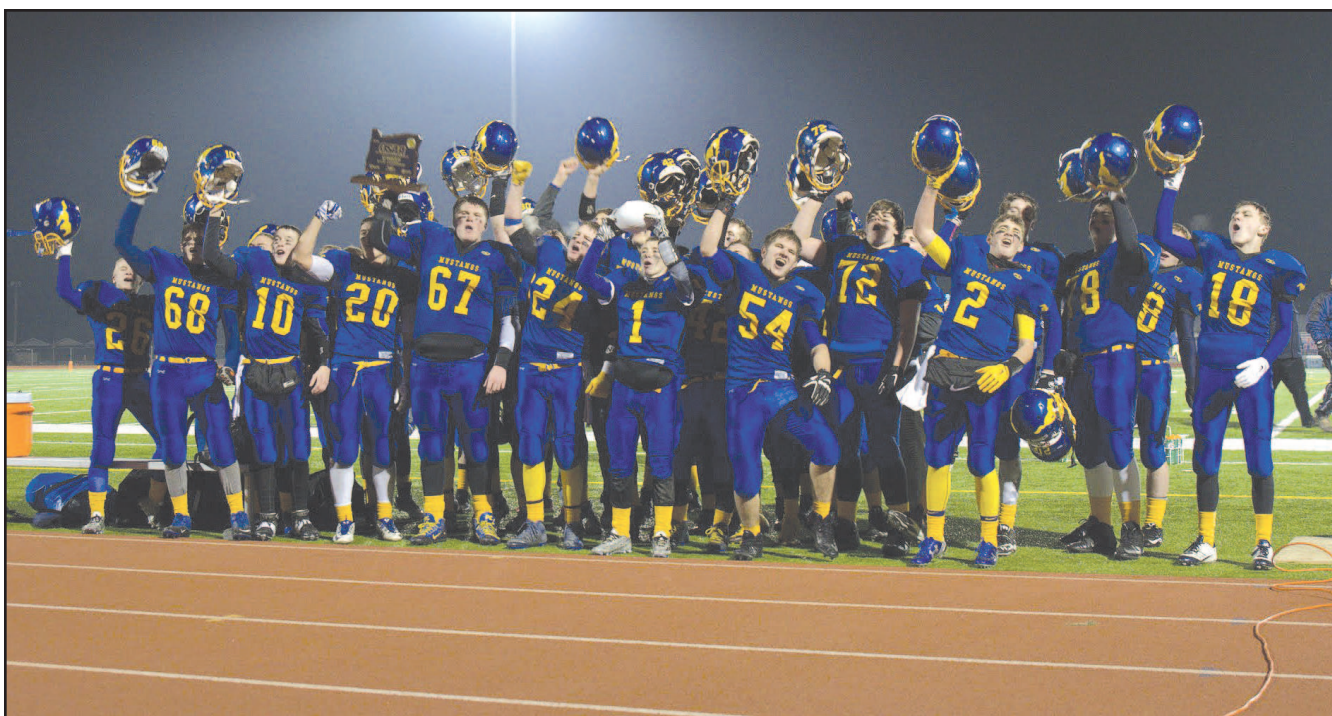
The frigid temperature last Saturday night couldn't lower the Mustangs' spirits as they raised their helmets in celebration under the lights on Hermiston's Kennison Field. The Heppner team secured the 2A state championship with a 48-0 win over Kennedy.

Trojans 'feel the 'stang' in 48-0 stomping by Heppner