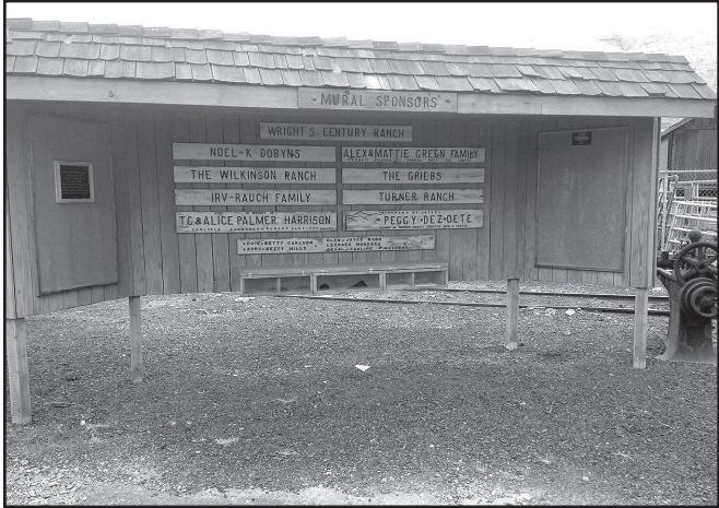
This kiosk on the agriculture museum property gives additional information about the museum and mural sponsors.