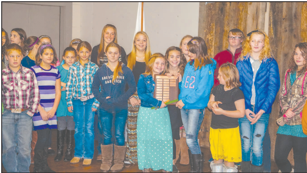
2014 4-H Achievement Night winners.

Morrow County 4-H asks leaders, members, families and supporters to save the date for the Morrow County 4-H Achievement Night on Sunday, Nov. 15, beginning at 4 p.m. at the Ione Legion Hall.