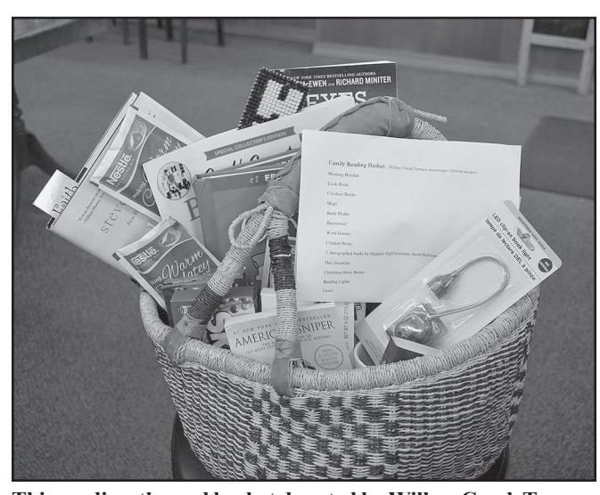
This reading-themed basket donated by Willow Creek Terrace is one of the many auction items that will be available at the Booster Club auction this weekend. Many of the items up for bid are on display around Heppner.

ed Heppner JR/SR High pner, Morrow County Grain Booster Club Steak Feed Growers, Bank of Eastern and Auction begins at 6 p.m. this Saturday, Oct. 10,