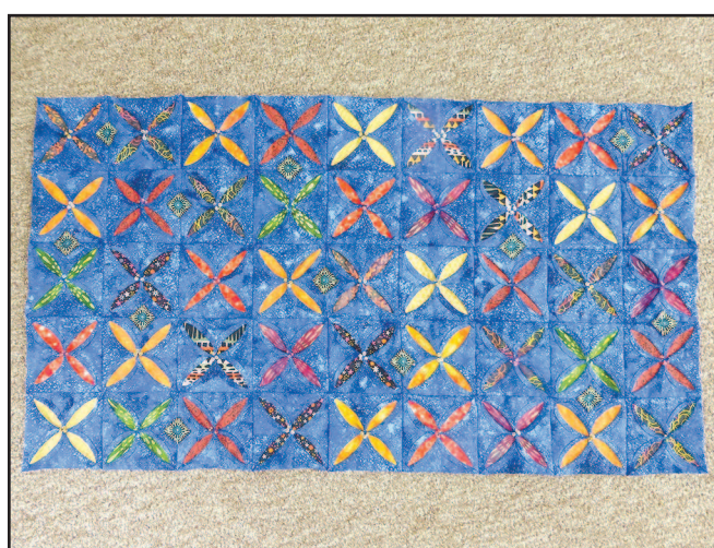
A special treat at the quilt show this year is a display of pyrotechnic quilts like this one.

Activities will include displays of heritage and contemporary quilts, wall hangings and quilted items. The Country Store will have new and vintage items for browsing, and regional fabric vendors will have exciting fabrics and tools for sale. There will be door prizes, and everyone can vote for the People's Choice Award. Lunch and pie will be available. The quilt raffle drawing will take place at 3 p.m.; winner need not be present.