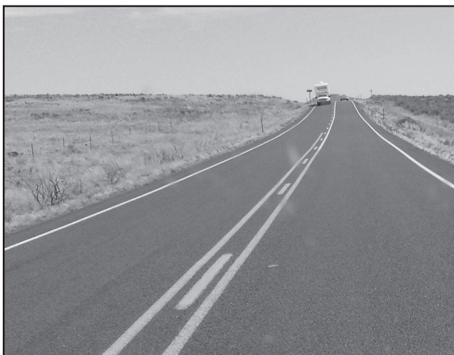
With the rise of speed limits on some highways, motorists are asked to watch for extended or added no-passing zones, like this one where a solid line is being painted to replace the skip lines.

HB 3402 will allow travelers to legally drive higher speeds on Interstate 84 between The Dalles and