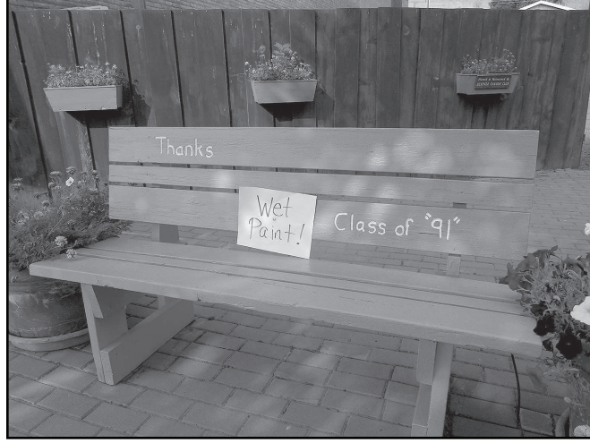
The benches throughout Heppner, originally donated by the class of '91, received a fresh coat of paint last week...but fairgoers might want to wait for the paint to dry before taking a seat.