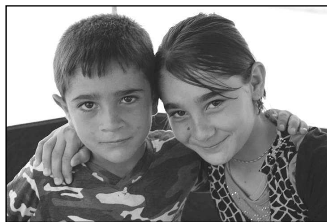
Yazidi kids. -Contributed photo

To learn more about World Orphans and to support World Orphans' work in Iraq, visit: http://worldorphans.org/iraq-emergency-fund/ .