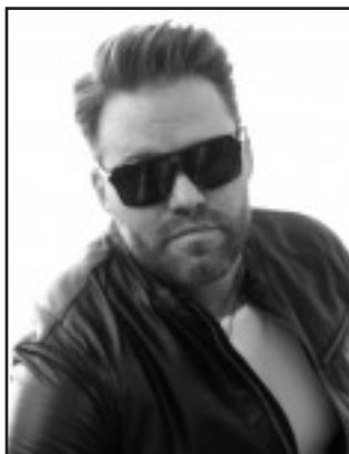
Two-time ACM award winner James Otto.

In 2008, Otto released the album "Sunset Man," which contained the single, "Just Got Started Loving You." The song went on to become Billboard's number-one single of the year. He also received the CMA Song of the Year Award for "In Color," which was also nominated for a Grammy. Otto, who has toured with Reba McEntire, Toby Keith, Trace Adkins and