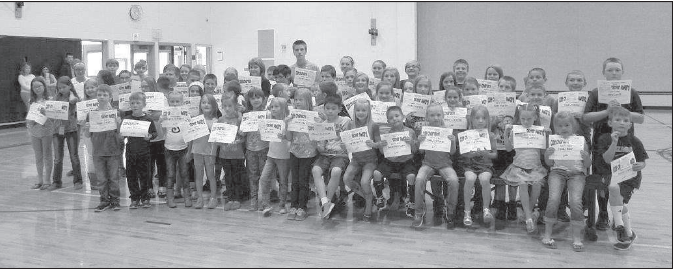
Heppner Elementary has announced the final Colt Character winners for the year. The character trait for April/May was Improving Yourself Continually. See story for list of winners.