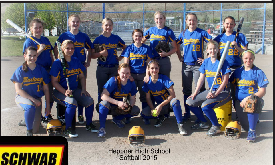
Heppner High School Softball 2015