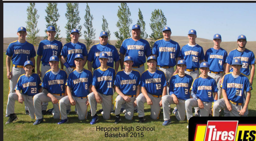
Heppner High School Baseball 2015