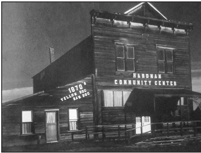
Members of the Hardman Community Center (pictured) held their annual meeting last week.