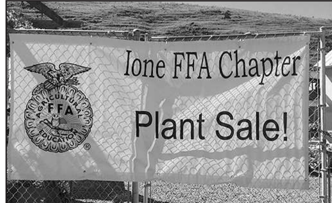
Ione FFA plant sale is this coming Saturday, May 1, from 7:30 a.m. to 4 p.m. at the Ione School Greenhouse (next to the tennis courts). Lots of hanging baskets and pots perfect for Mother's Day gifts will be available.