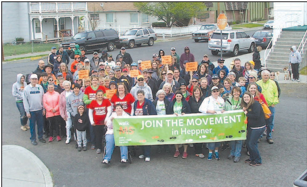
Sixty-four people turned out for this year's EO Walk MS Heppner, which organizers hailed as a success.