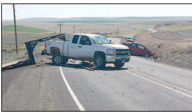
This crash near the Lexington airport claimed the life of Richland man Neal Reau.

Preliminary investigation showed that a red, 2009 Honda Fit, driven by Neal Reau, 35, of Richland, WA, was traveling southbound The Honda then sideswiped