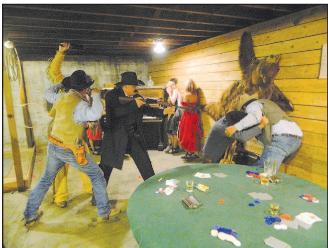
Pendleton's Underground Comes to Life tour treat visitors to lively scenes like this bar fight during the two-hour tour.