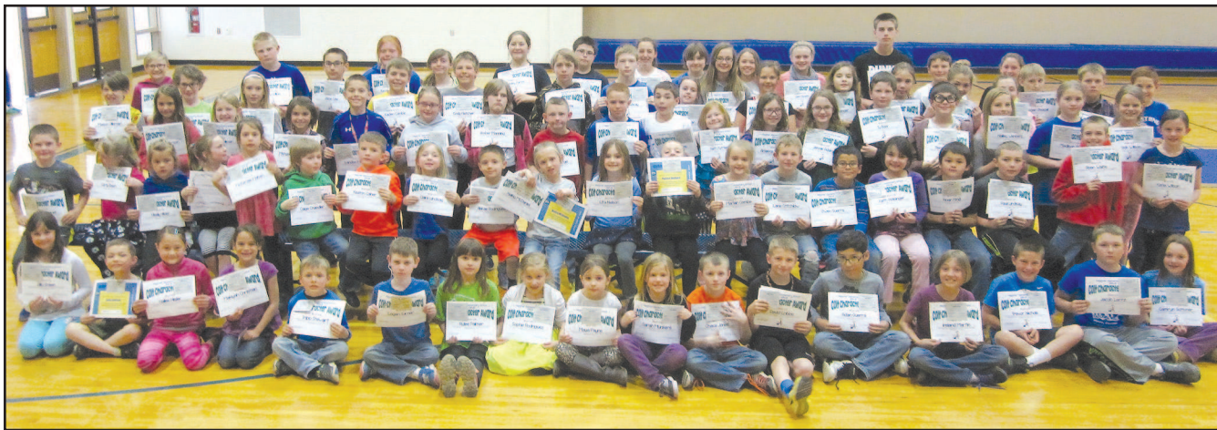
Heppner Elementary Colt Character Award Recipients from the assembly on April 15 (see story for list of names). The trait was Telling Yourself the Truth, which included self-honesty, integrity, trust and forgiveness.

Heppner Elementary School has announced the Colt Character Award recipients for March. The trait for March was Telling Yourself the Truth, which included self-honesty, integrity, trust and forgiveness. Recipients listed by class are as follows: